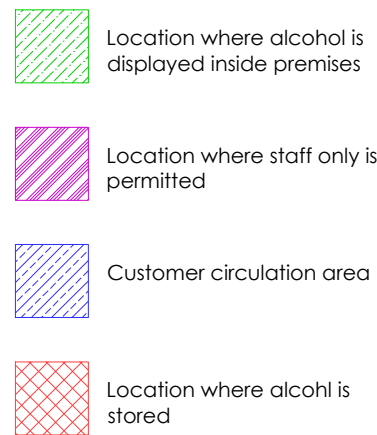
1 Activity Plan Scale 1:100